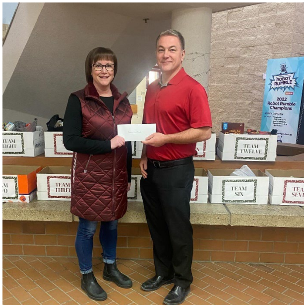
Rosetown High School