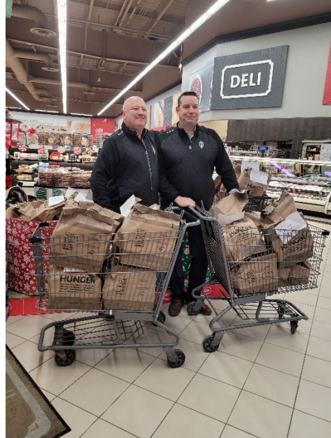
Prince Albert Raiders