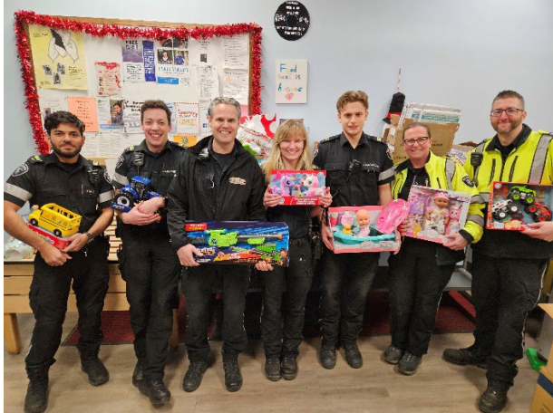
WPD Ambulance Care, North Battleford