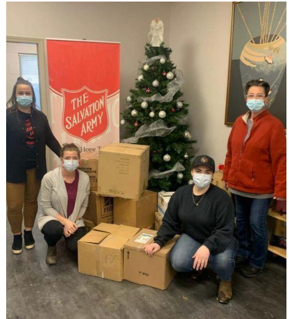
Clockwise from top left: volunteers pack hampers in Wadena, Moose Jaw, Weyburn and Melfort.