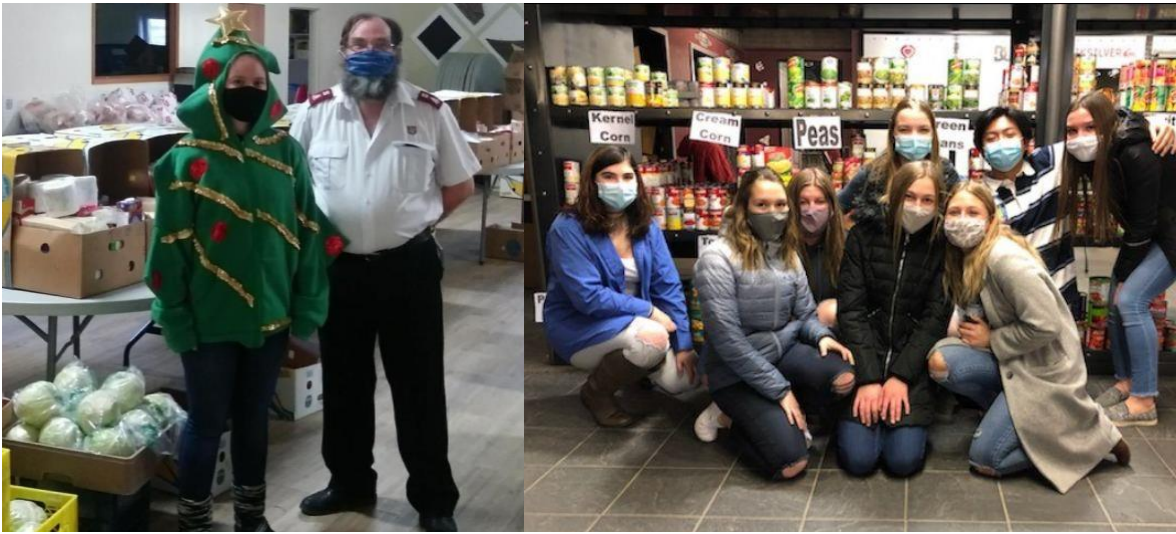
Donors and volunteers with donations in the Battlefords, Maple Creek, and Kindersley.